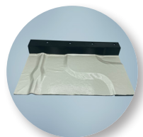
Case, Module Component Level