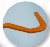
Busbar & High Voltage Cable